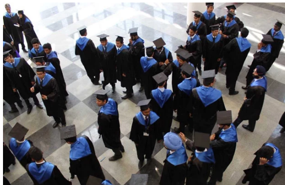
The VP advised the students to not be content with merely 'managing' well but must learn to lead.

Education | NDTV Education Team | Updated: Mar 25, 2018 7:47 pm IST | Source: NDTV